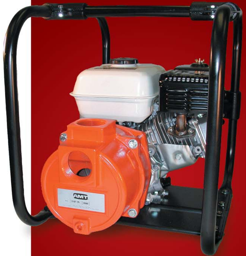
316F-95 Dredging Pump