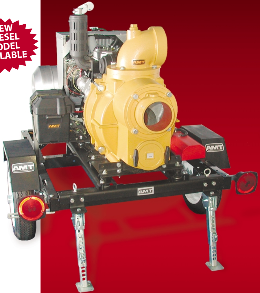
6" Diesel Driven Trash Pump

The AMT 6" engine driven pump is designed for applications requiring high volume flow and solid/debris handling capabilities. Pump is constructed of heavy duty sand cast aluminum with cast iron and stainless steel internal parts for wear resistance and durability. Patent pending built-in slide mechanism features nylon and powder coated steel components that permit servicing, repairing and cleaning entire pump without removing hoses or pump components from trailer. Digital tachometer/hourmeter.